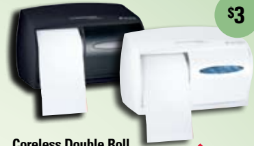
Coreless Double Roll Bath Tissue Dispenser 09605 Pearl White; 09604 Smoke/Grey