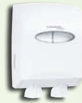
Twin Hygienic Bath Tissue Dispenser 74418 Pearl White