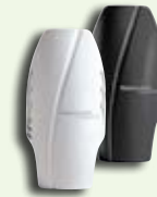
KIMCARE* Continuous Air Freshener Dispenser 92620 White; 92621 Black