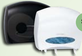
JRT Jr. ESCORT* Jumbo Roll Bath Tissue Dispenser with Stub Roll 09507 Smoke/Grey; 09508 Pearl White