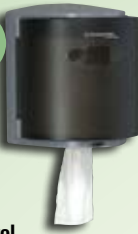
SCOTT® Roll Control Center-Pull Towel Dispenser 09337 White; 09989 Black/Grey