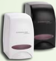
Cassette Skin Care Dispenser 92144 White; 92145 Black/Grey