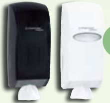
Hygienic Bath Tissue Dispenser 74415 Smoke/Grey; 74416 Pearl White