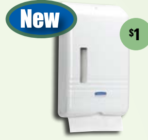
SANITOUCH* Towel Dispenser 09995 Pearl White; 09996 Smoke/Grey