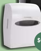
09993 Pearl White (plastic)