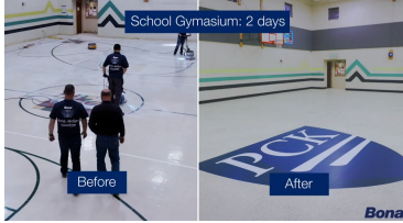
BONA Resilient Floor System