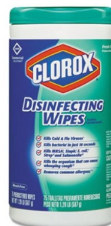
Clorox Disinfecting Wipes Fresh Scent, 6/75CT/CS

Optical Brighteners to Enhance the Beauty