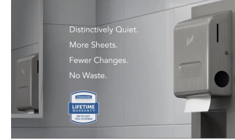
SCOTT PRO eHRT