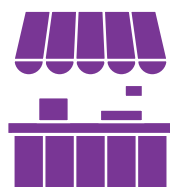
Visiting seafood market, contact with live or dead animals