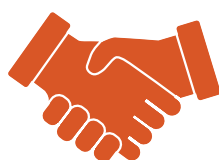
Person to person transmission