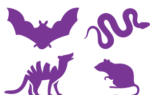
Bats and game animals