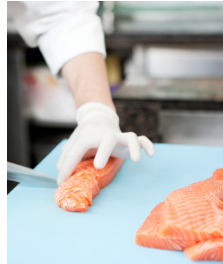
Food Prep Surfaces