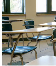
Desks and Table Tops