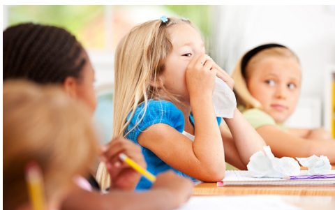
Cough or Sneeze into Your Sleeve or a Tissue