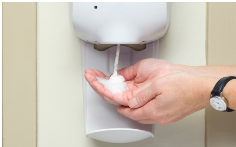
Use Hand Sanitizer