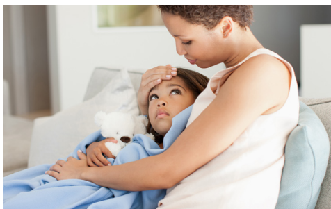
Stay Home if You Are Sick