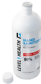
Level 1 Hand Sanitizer

Hand Sanitizer is a must-have in every environment. Here are some new options for Nichols Customers!