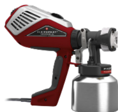
Tital Flex Spray Handheld 115 Volt Sprayer