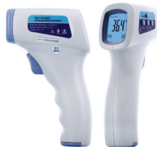
Infrared Digital No Touch Thermometers

Even more to help keep your teams safe at work