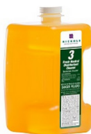
Fresh Neutral Disinfectant Cleaner

Use with your choice of ProFil Dispenser