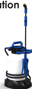
FOAM-IT Liter Pump Up Spray Mister