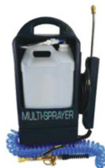
Multisprayer M1 complete with finer spray tip